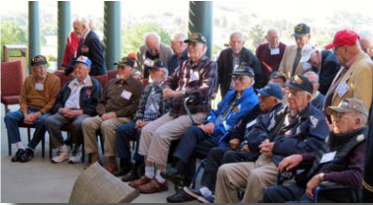
January 2020. The "final call" Vitory Tribute to our WWII veterans was held at the SLO Country Club in conjunction with the MOWW.