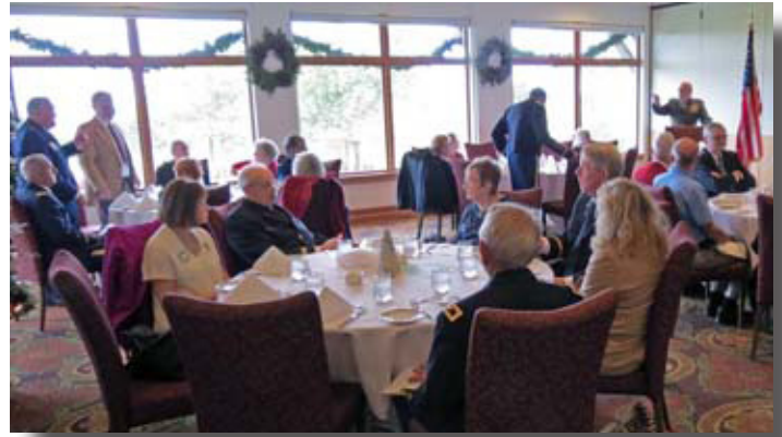
The December meeting was also a joint affair with the MOWW, held at the SLO Country Club